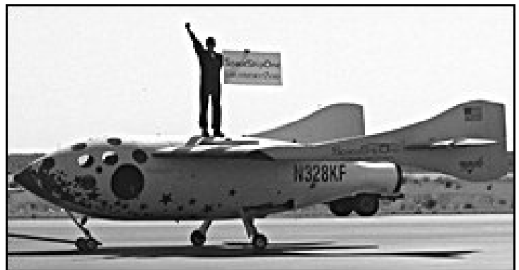
Private enterprise is conquering outer space!